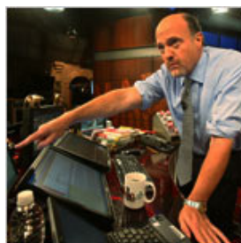
Jim Cramer Retreats Along With the Dow