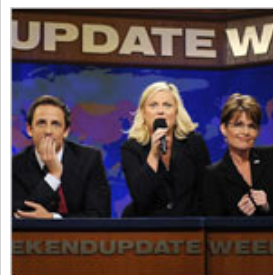
Sarah Palin Looking Like a Real Entertainer