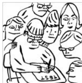
Letters: Do Our Schools Invite Cheating?