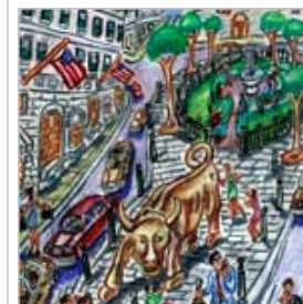
Artist of Rich Shoppers Sells on Madison Ave.