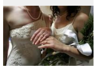
1 of 1 Full Size

Email | Print | Share | Reprints | Single Page | Recommend (9) [-] Text [+]